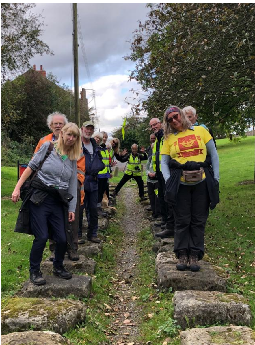
Friends of the S&DR at Brusselton.

The work doesn't finish at the end of 2025. We will still be working hard to rescue the world's earliest railway station at Heighington, Edward Pease's house in Darlington and many more special places. We won't wait another 50 years to celebrate the S&DR. We are planning a mini S&DR Festival every September. Do join us for the next leg of our journey!